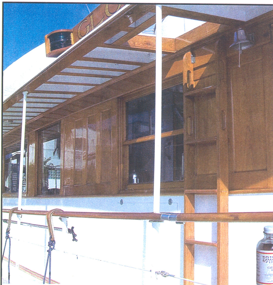
M/V Glory, 1955 68' Trumpy