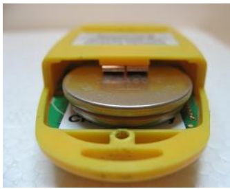
forward as far as it will go.