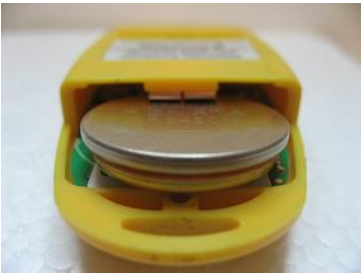
4. Insert new battery, 5. Push battery positive (+) side facing up.